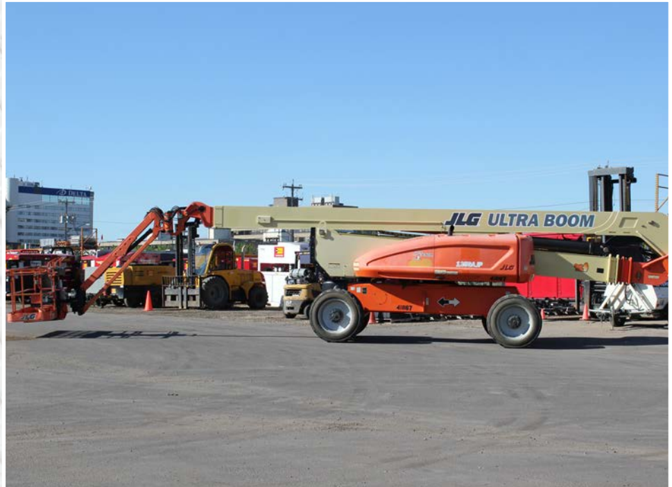
2007 JLG 1250AJP