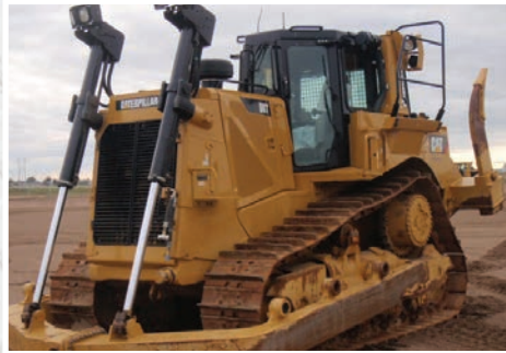
2013 Cat D8T (1 of 3)