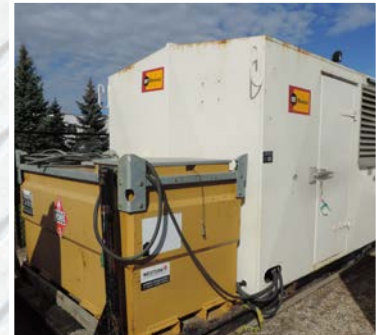
2002 Cat DH250