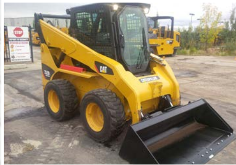
2014 Cat 252B3