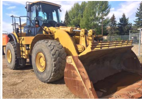
2012 Cat 980H

2012 Xtreme 2045 2012 Xtreme 1270 2010 Cat TL1255 (2) 2007 Cat TL1055 2011 Cat TL943 2008 Cat TL943