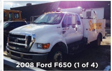
2008 Ford F650 (1 of 4)