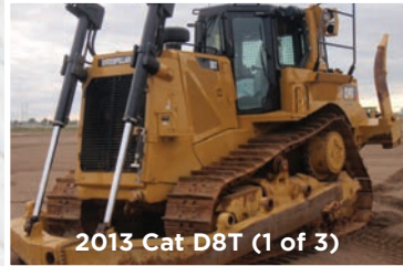
2013 Cat D8T (1 of 3)