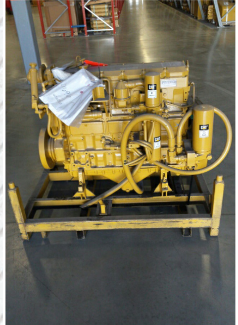
Cat Reman 3116 Engine for 320, 320B