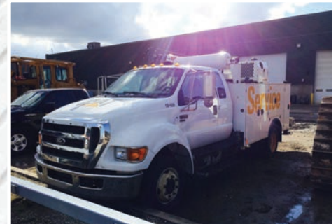
2008 Ford F650 (1 of 4)