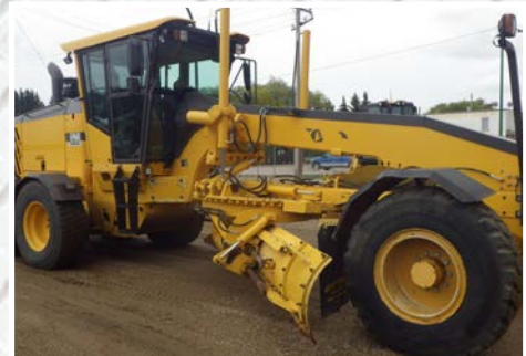
2009 Volvo G960