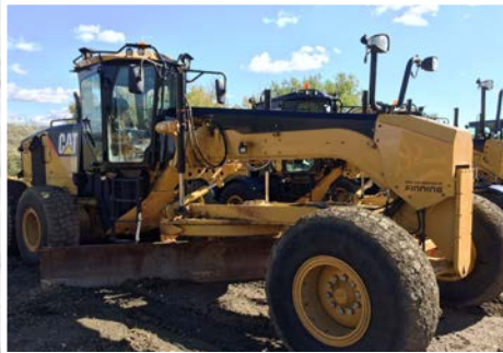
2011 Cat 14M

2011 Cat 14M 2009 Cat 140M (4) 2008 Cat 160M 2011 Deere 772GP 2008 Deere 870D 2009 Volvo G960