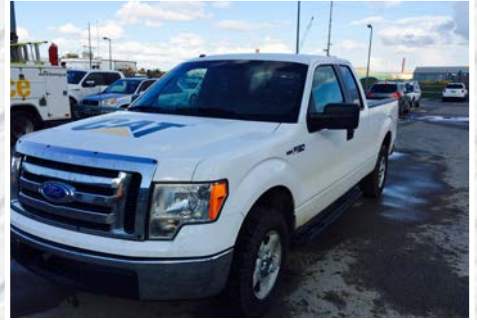
2009 Ford F150