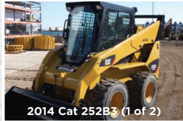
2014 Cat 252B3 (1 of 2)