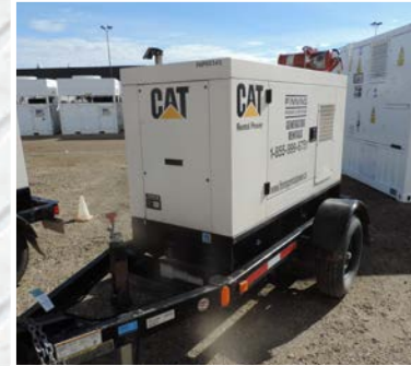
2008 Cat XQ20