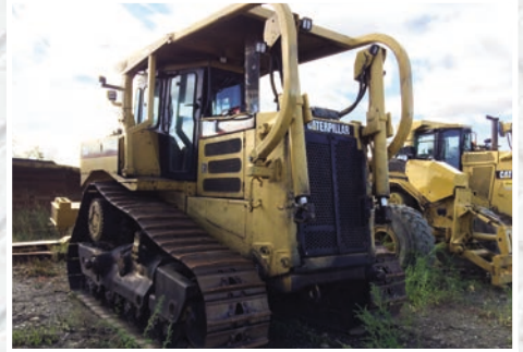
2004 Cat D8R Series II