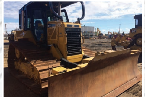
2012 Cat D6N LGP