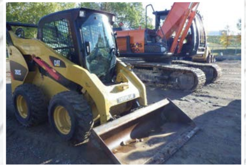
2010 Cat 262C