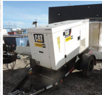
2005 Cat XQ20