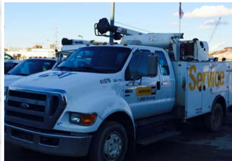
2008 Ford F650 (1 of 4)