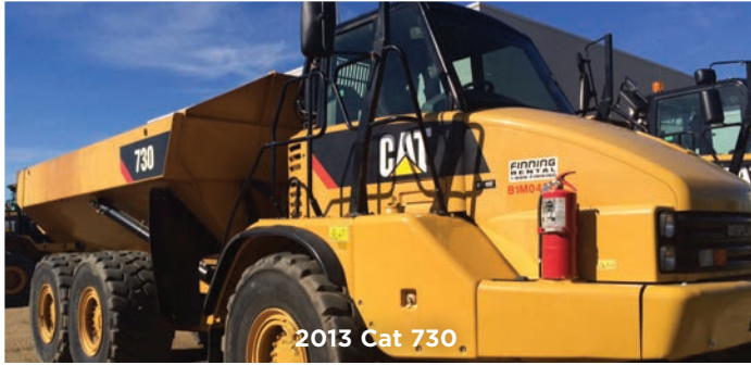
2013 Cat 730