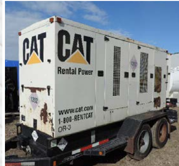
2002 Cat XQ125