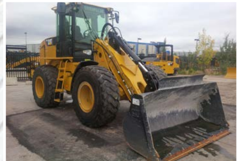
2012 Cat 924H