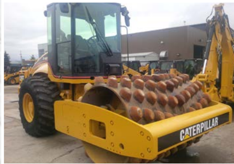
2007 Cat CP-563E