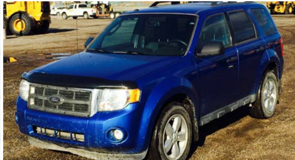
2012 Ford Escape