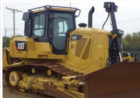
2011 Cat D7E