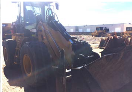
2013 Cat 930H