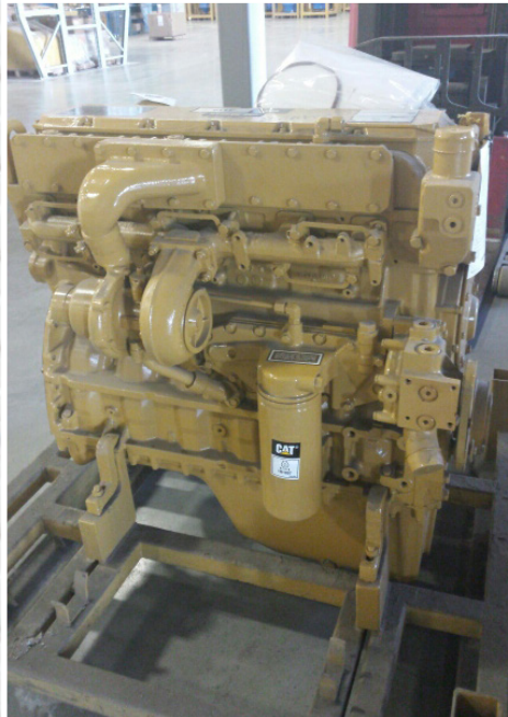
Cat Reman 3116 Engine for 950F, 960F

8E7700 Track Assembly for D8 44 Section. 22" ES Shoes Cat Reman 3116 Engine for 950F, 960F - Unused Cat Reman 3116 Engine for 320, 320B - Unused