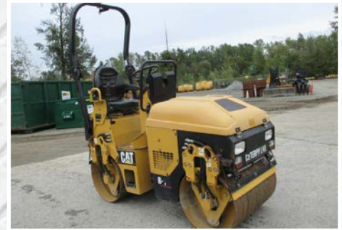
2006 Cat CB-114