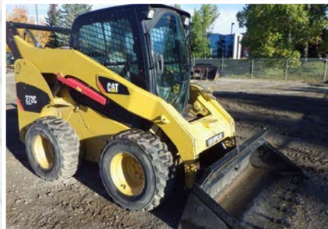
2011 Cat 272C