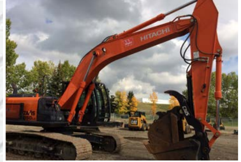
2013 Hitachi ZX250LC-5