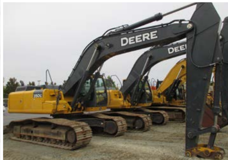
2011 Deere 350G