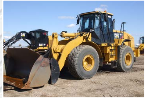
2012 Cat 966H