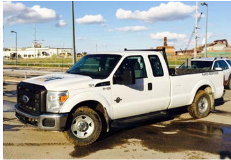
2011 Ford F250 Super Duty