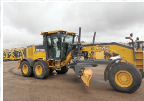
2011 Deere 772GP