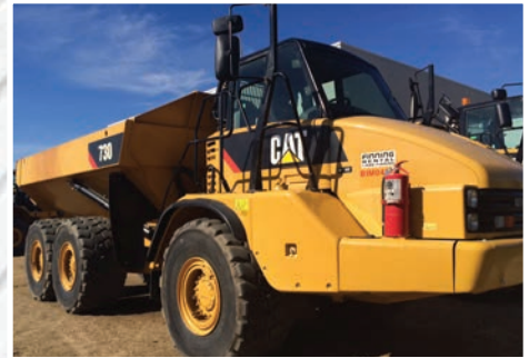
2013 Cat 730