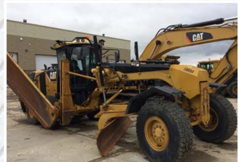
2009 Cat 140M (1 of 4)