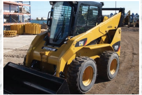
2014 Cat 252B3