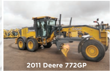
2011 Deere 772GP