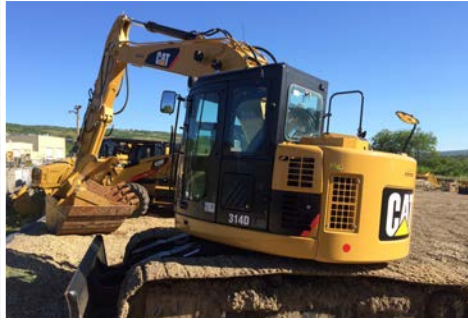
2013 Cat 314D